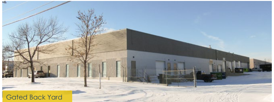
Gated Back Yard

Blackstone Unit A210, 9705 Horton Road SW, Calgary, Alberta, T2V 2X5 P (403) 214-2344 www.blackstonecommercial.com