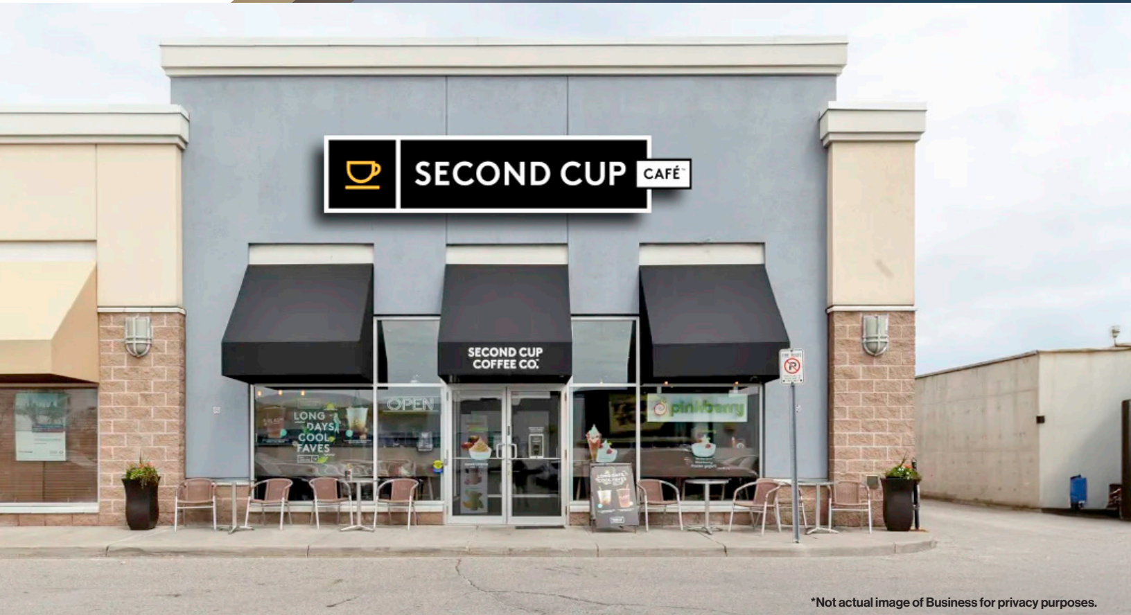
*Not actual image of Business for privacy purposes.