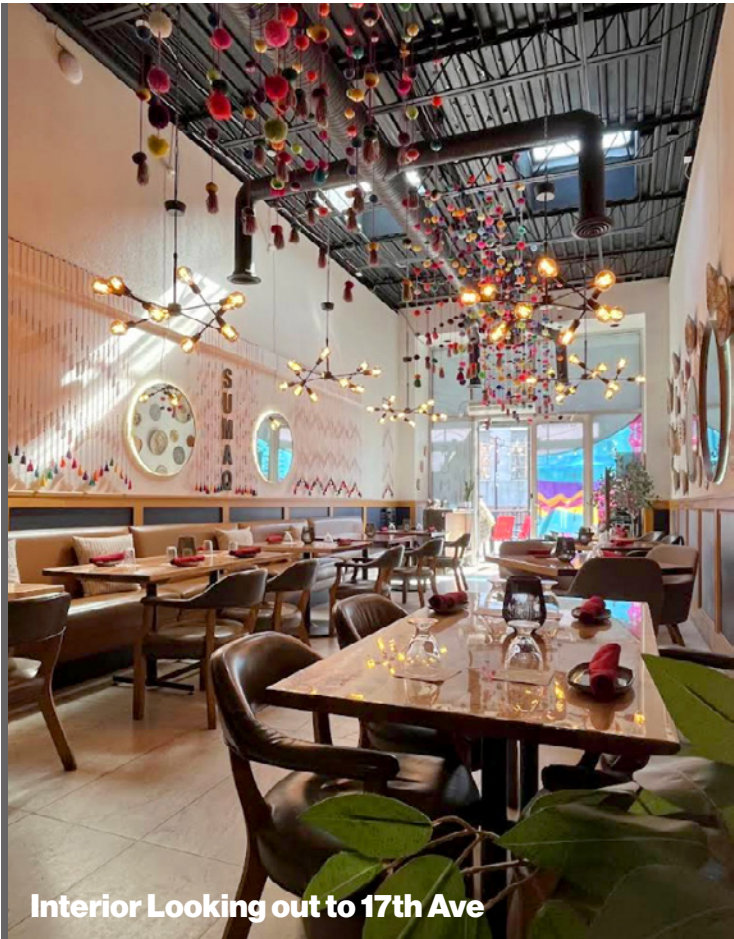
Interior Looking out to 17th Ave