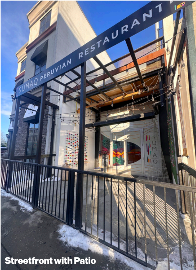
Streetfront with Patio