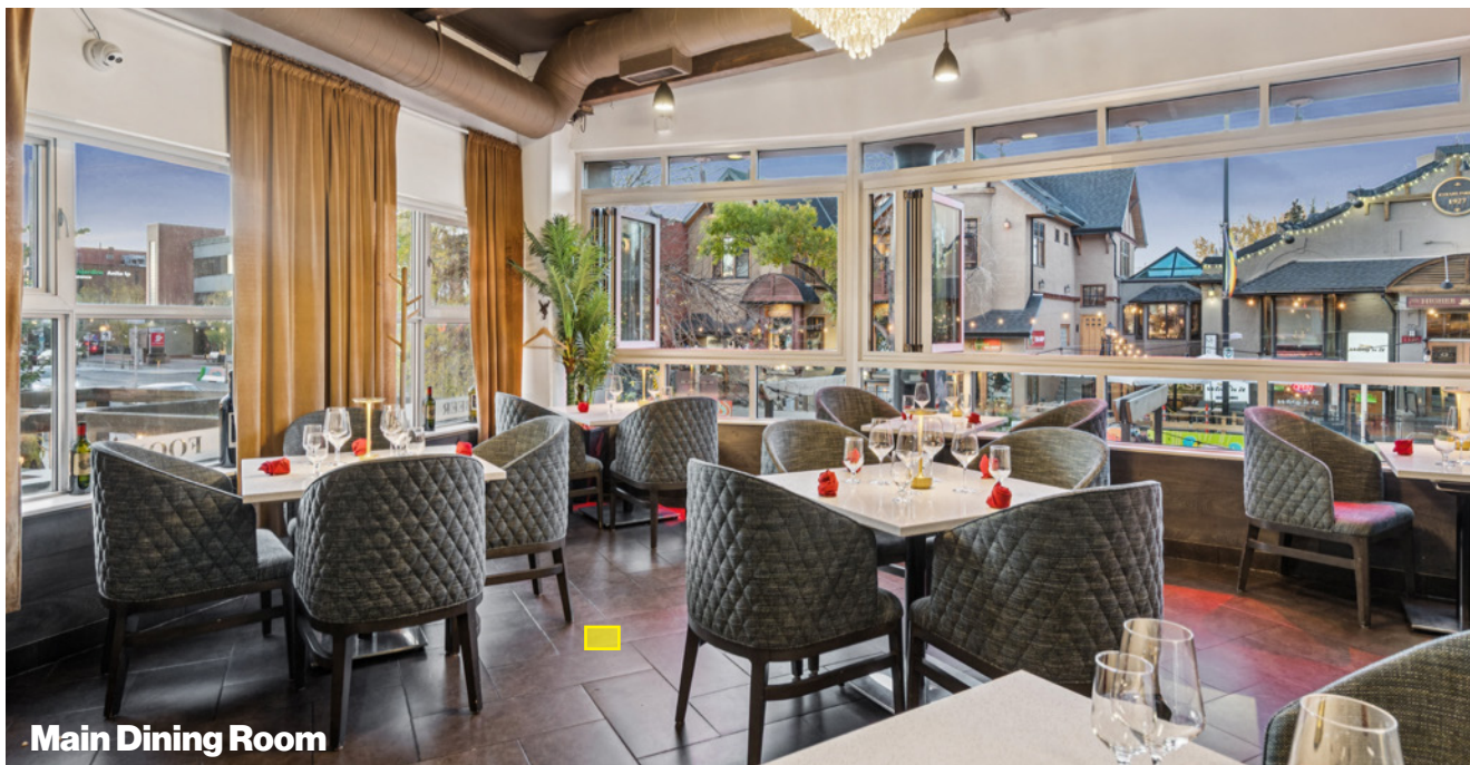
Main Dining Room